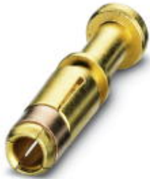
Crimp contact, turned, Single contact, Contact diameter: 2 mm, Crimp range: 1 mm 2 ...2.5 mm 2

Please be informed that the data shown in this PDF Document is generated from our Online Catalog. Please find the complete data in the user's documentation. Our General Terms of Use for Downloads are valid ( http://phoenixcontact.com/download )