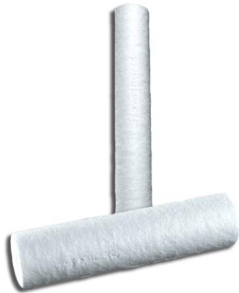
Figure 1: Hytrex Depth Cartridge Filters